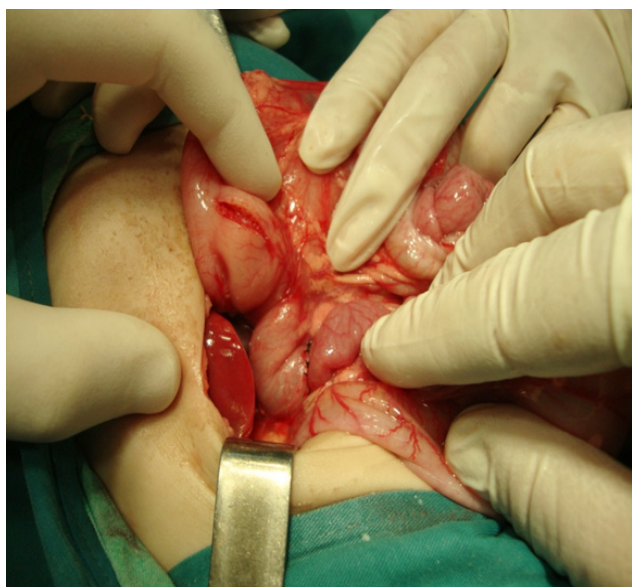
Figure 5. A latero-lateral duodeno-duodenal anastomosis.