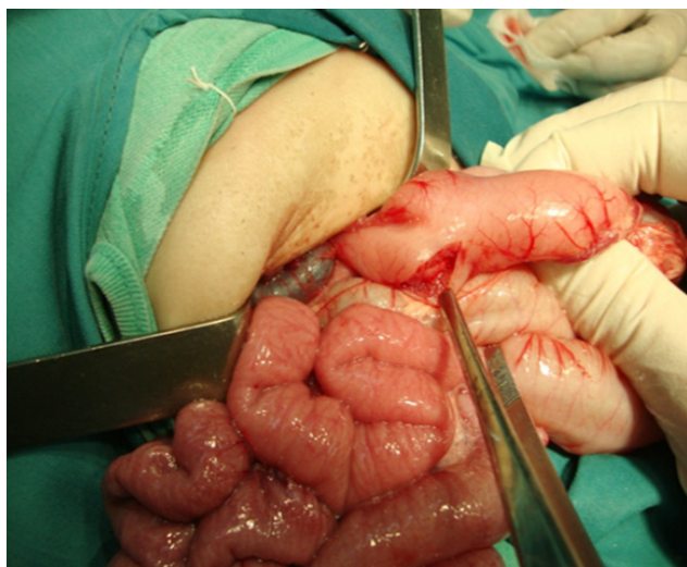
Figure 4. Fredet-Ramstedt pyloromyotomy.

disturbances, with half saline and glucose 5% and human albumin, the control abdominal radiographs confirmed the presence of two hydroaeric levels, one of which was from contrasting material and stayed more than 48 hours. After a long discussion, with clear data for difficult gastric evacuation, with a hypothetical diagnosis of duodenal stenosis and/or pyloric stenosis, it was decided to proceed with surgical treatment.